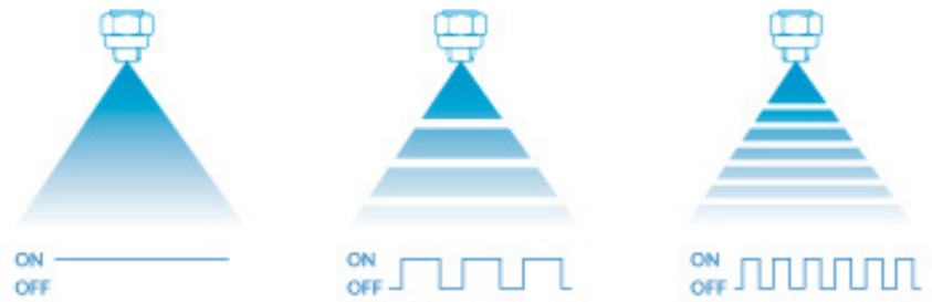
Pulse Width Modulation

A further technique available to electric nozzles also allows for good dosing control. Pulse Width Modulation (PWM) takes advantage of the very rapid on/off cycles available to electric nozzles. By pulsing the nozzle on and off very rapidly the flow rate from the nozzle can be reduced without compromising consistency precision. Normally if a nozzle was pulsed, we would see a degradation in the consistency of any coating produced but with 150Hz pulsing no noticeable effects on consistency can be seen. So, with a 50% on to 50% off very rapid cycle we can reduce the flow rate from the nozzle by 50%